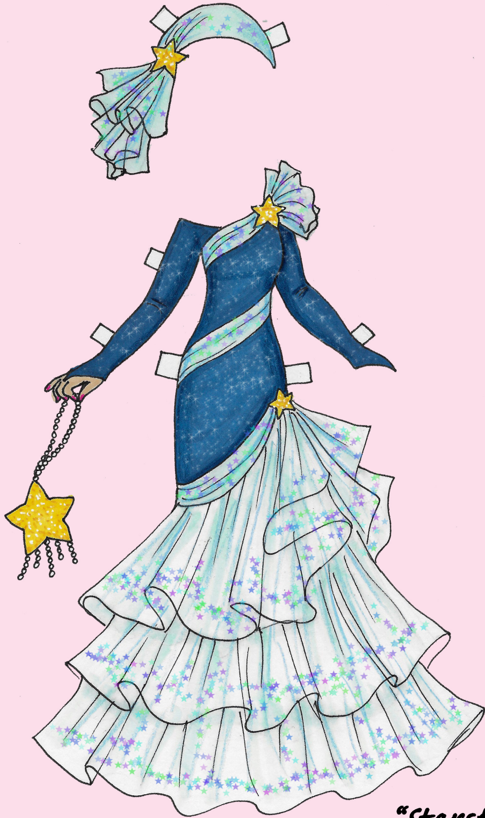
"Starstruck" Design by D. Vining